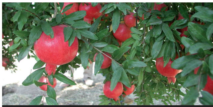
Tree with fruit