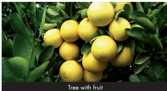
Tree with fruit