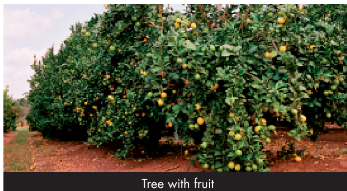
Tree with fruit